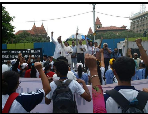
(Silent Peace Rally on 6 th August 2018)