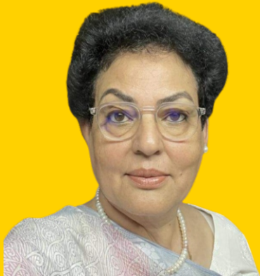
Chief Guest (Inauguration) Smt. Rekha Sharma Chairperson, NCW